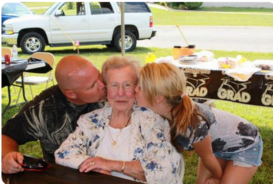
love our Mamaw